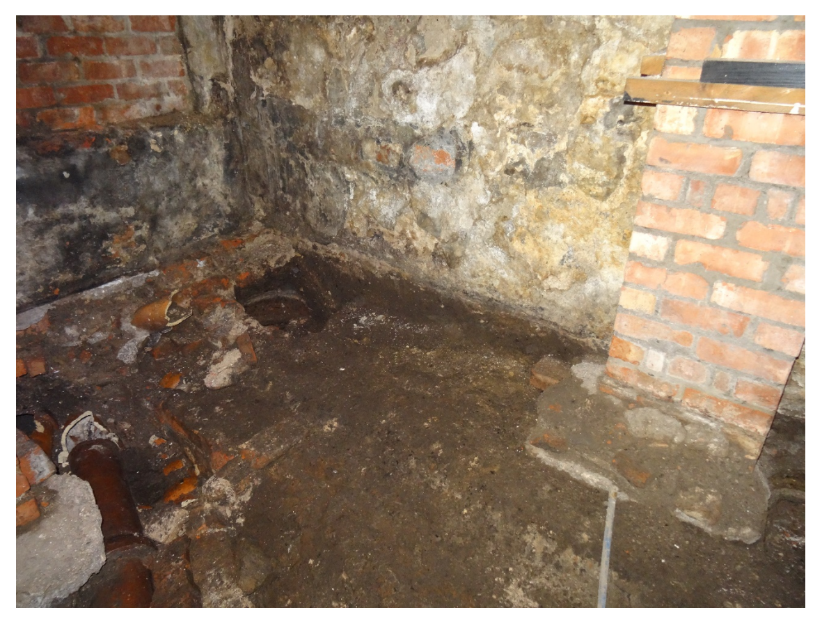
Fig 5. Basement walls founded on earth with inadequate foundations.