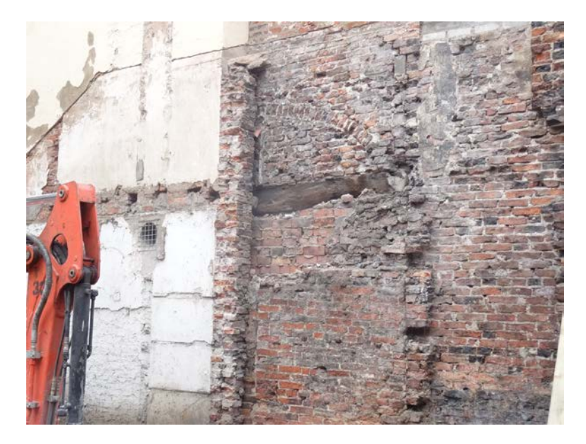
Fig 2. – Condition of newly exposed party walls – several areas of defective masonry.