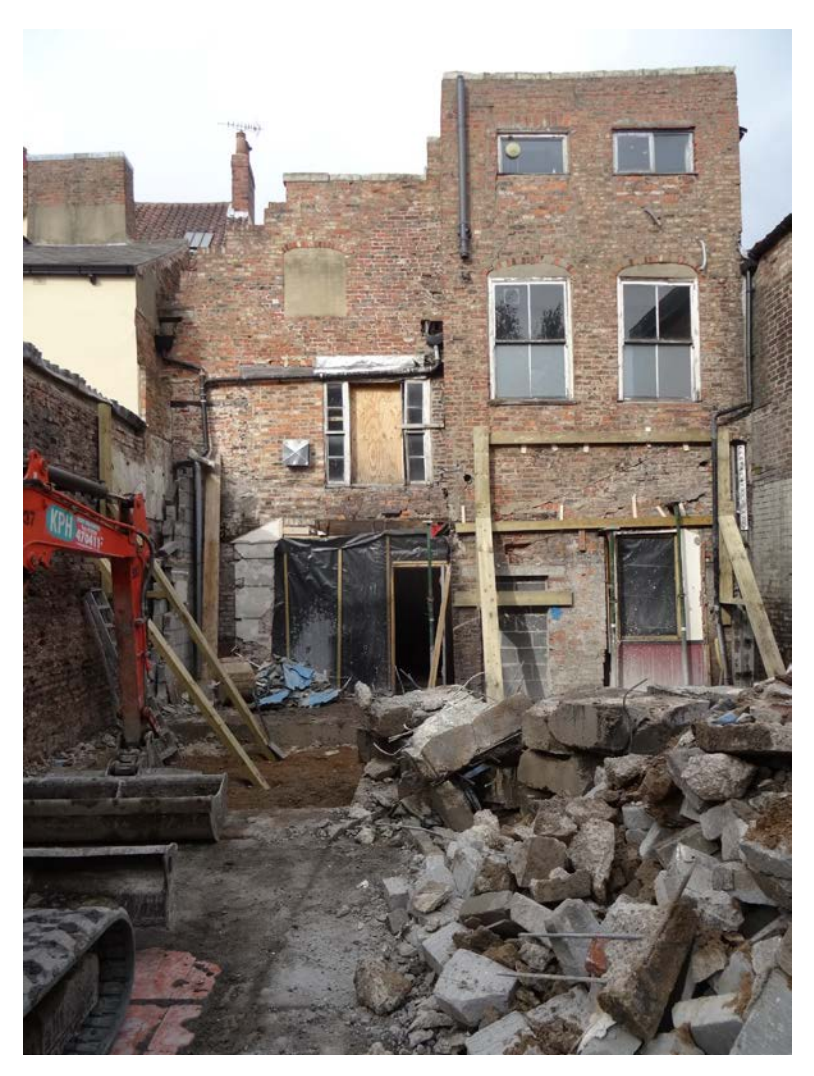
Fig 1. – Rear elevation.