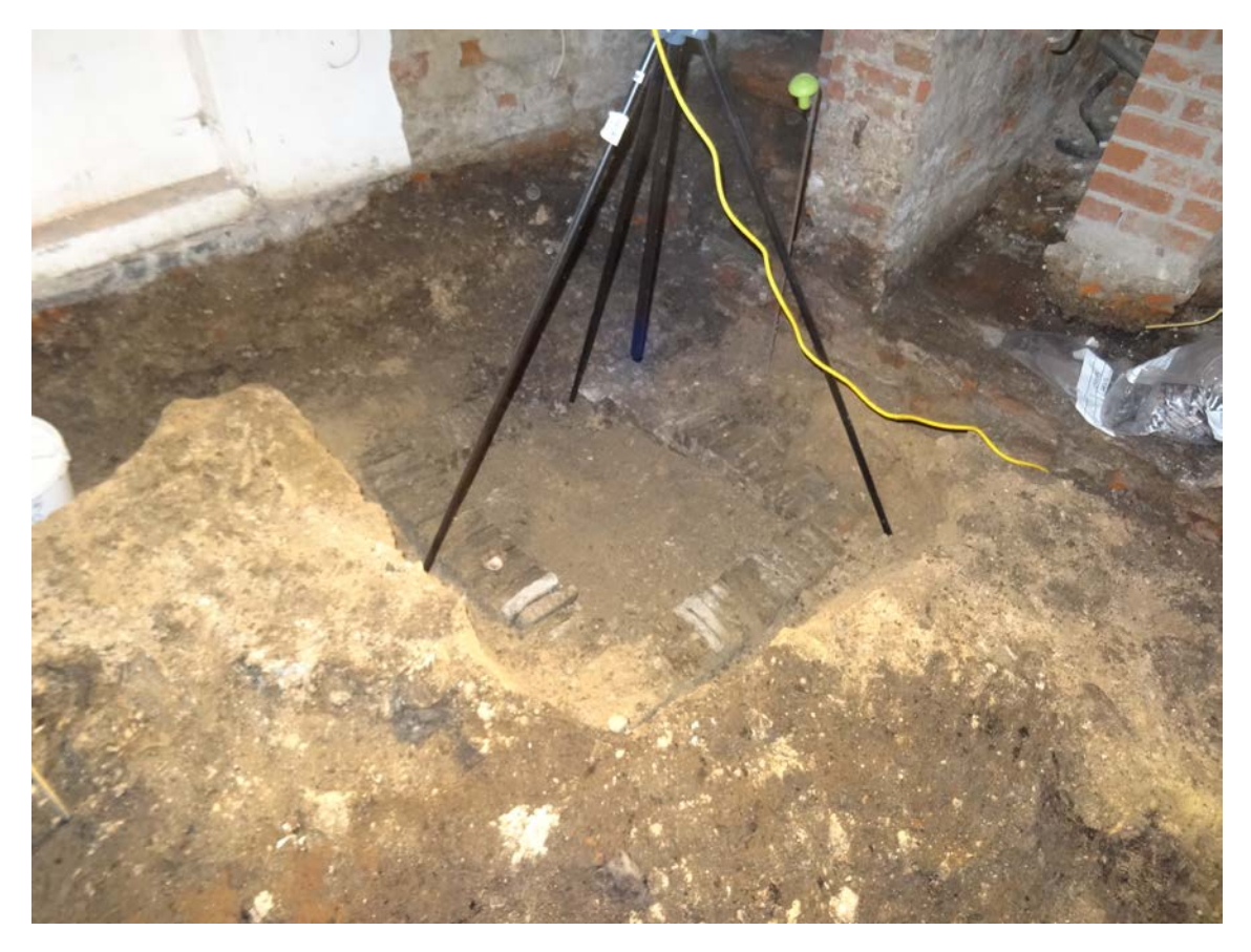
Fig 4. Roman structures in west basement.