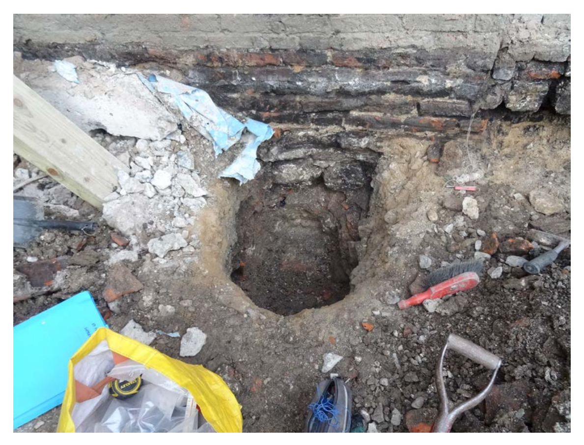
Fig 3. – Discovery of medieval walls below party walls.